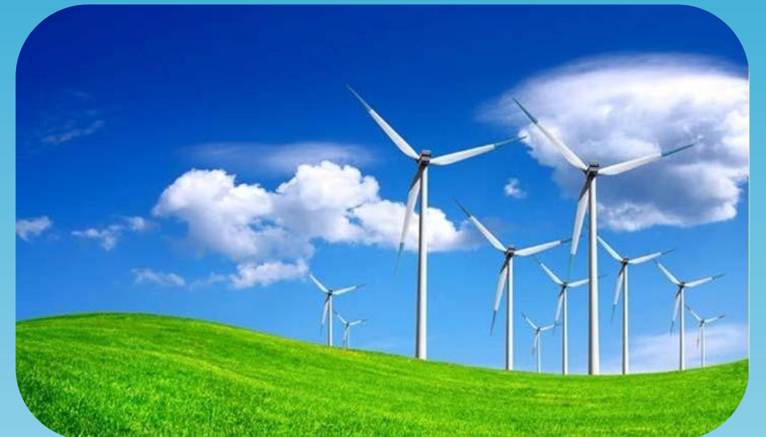
wind power industry