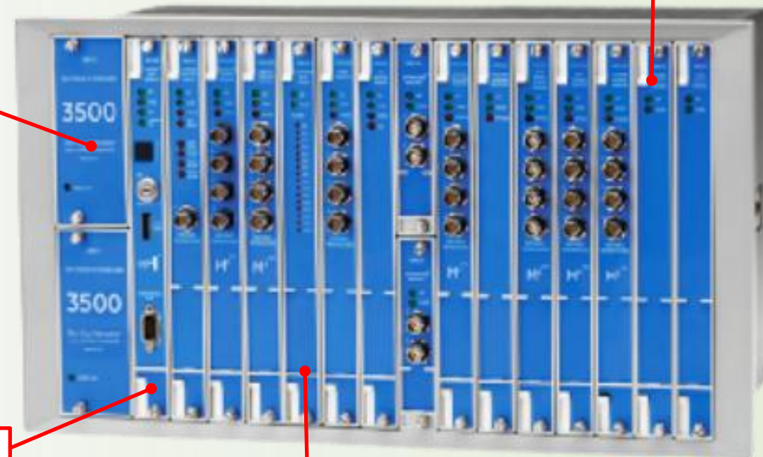
3500/32 Relay I/o Module