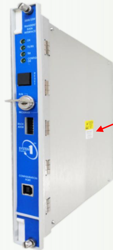
3500/22M Transient Data Interface Module