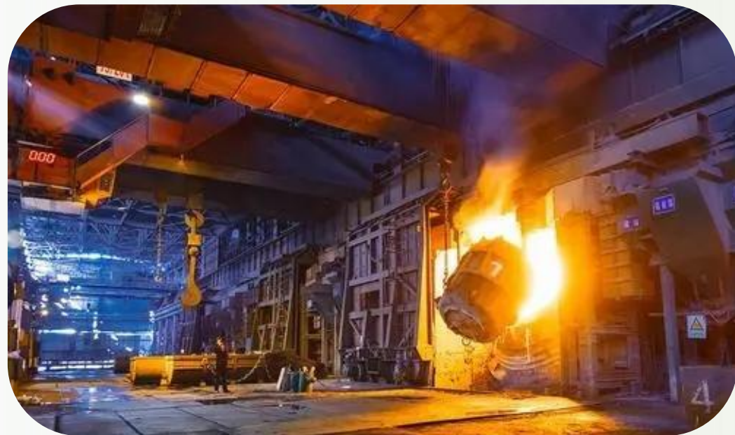
iron and steel industry