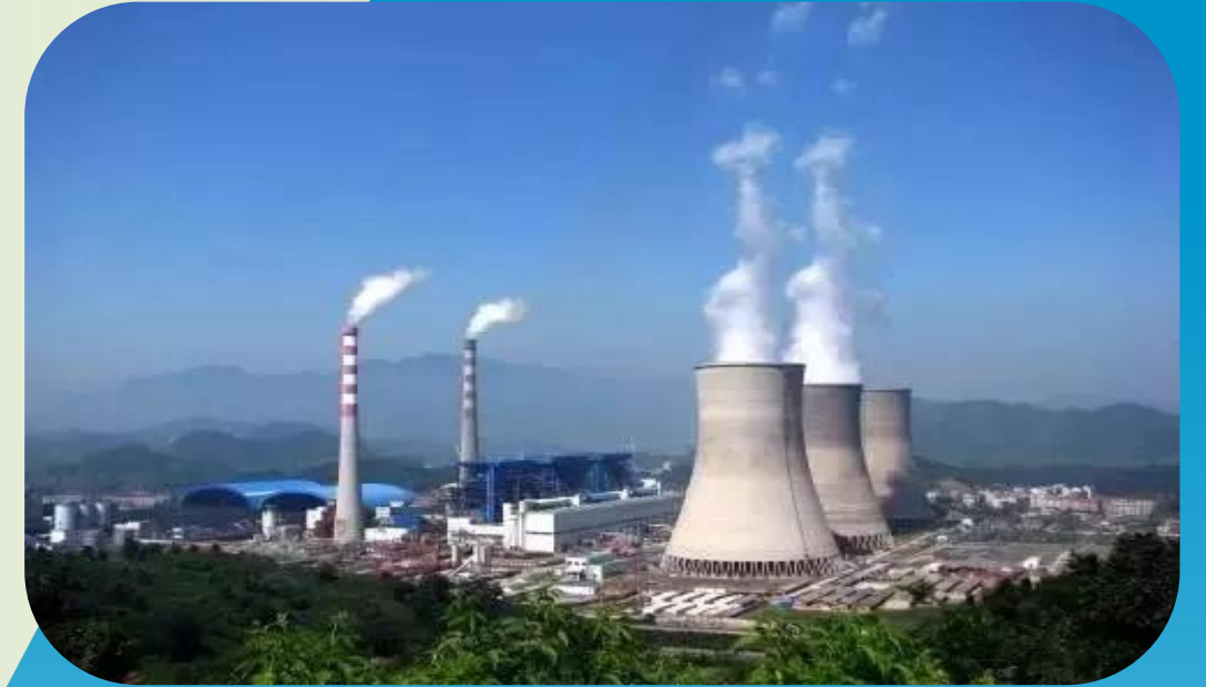
Thermal power industry