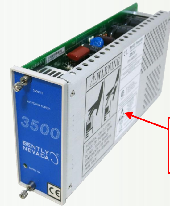
3500/15 power module